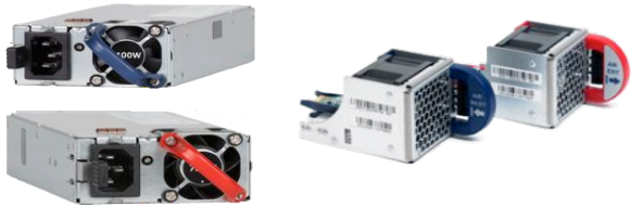
Hot swap and reversible power supply and fan modules