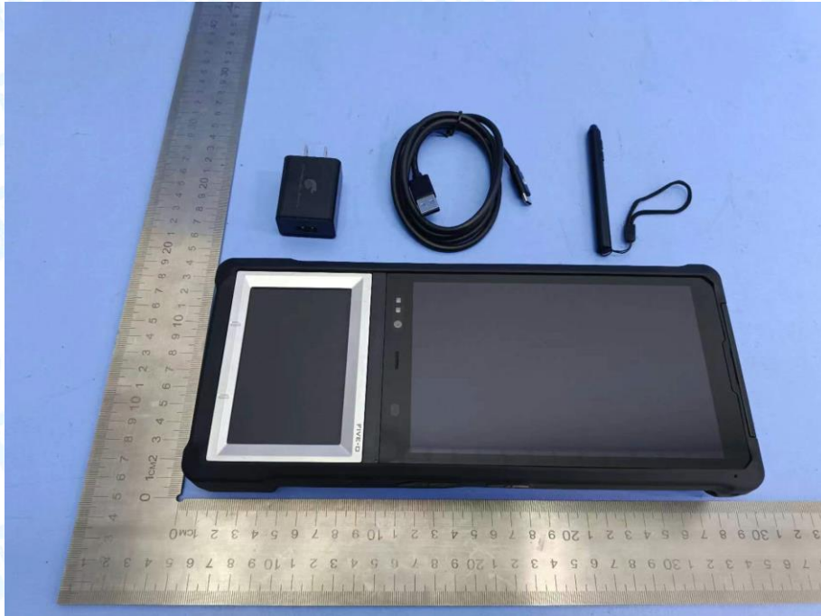
Photo 2 Appearance of Adapter