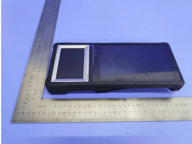
Photo 6 Appearance of EUT