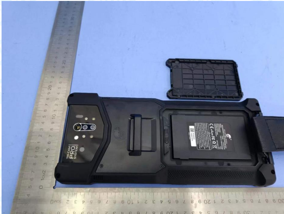
Photo 8 Appearance of EUT