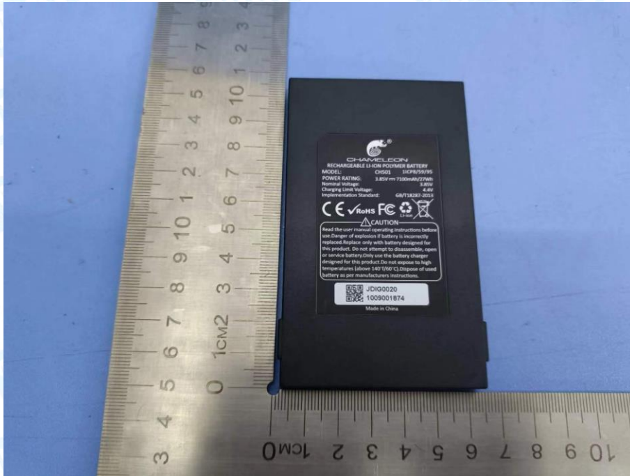
Photo 10 Appearance of EUT