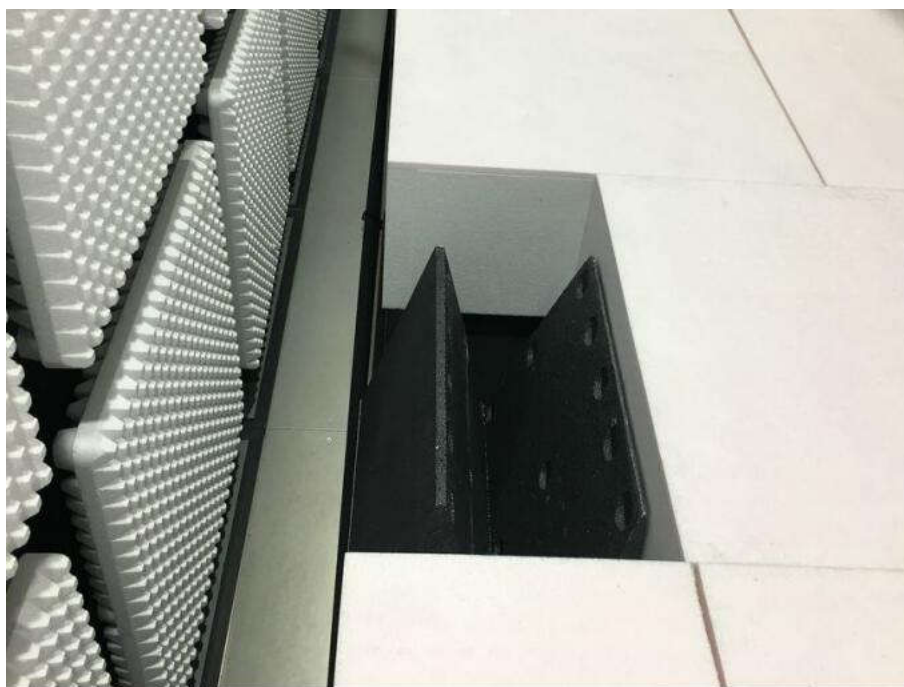
Radiated spurious emission Test Setup-3(Above 1GHz) There are absorbing materials under the ground.