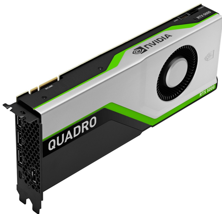
Figure 10. ThinkSystem NVIDIA Quadro RTX 5000 GPU

The Quadro RTX 5000 is equipped with 3072 CUDA cores, 384 Tensor cores, 48 RT cores and 16GB GDDR6 memory. It can render complex models and scenes with physically accurate shadows, reflections, and refractions to empower users with instant insight.