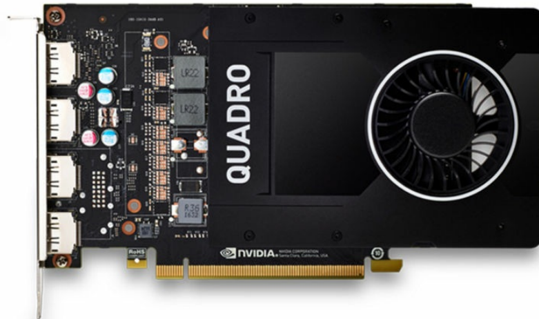
Figure 14. ThinkSystem NVIDIA Quadro P2000 GPU

ThinkSystem Quadro P2000 features a Pascal GPU with 1024 CUDA cores, large 5 GB GDDR5 on-board memory, and the power to drive up to four 5K (5120x2880 @ 60Hz) displays natively. This makes it an excellent choice for accelerating product development and content creation workflows that demand fluid interactivity with large, complex 3D models and scenes.