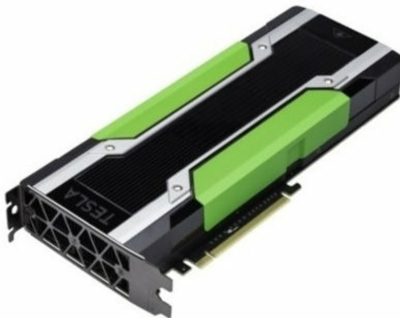
Figure 6. ThinkSystem NVIDIA Tesla M60 GPU

ThinkSystem NVIDIA Tesla M60 is a dual-slot 10.5 inch PCI Express Gen3 graphics card with two high-end NVIDIA Maxwell graphics processing units (GPUs). The Tesla M60 has 16 GB GDDR5 memory (8 GB per GPU) and a 300 W maximum power limit. M60 is offered as a 300 W passively cooled adapter that uses system airflow to keep the card within its thermal limits.