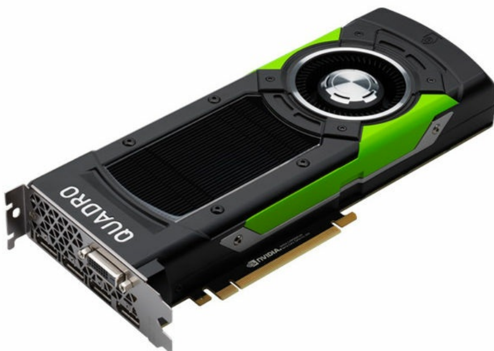
Figure 11. ThinkSystem NVIDIA Quadro P6000 GPU

ThinkSystem NVIDIA Quadro P6000 is the world's most advanced professional graphics solution ever created, combining the latest GPU, memory and display technologies that result in unprecedented performance and breakthrough capabilities. Professionals across of range of industries can now create their most complex designs, solve the most challenging visualization problems and experience their creations within the most detailed, life-like VR environments.