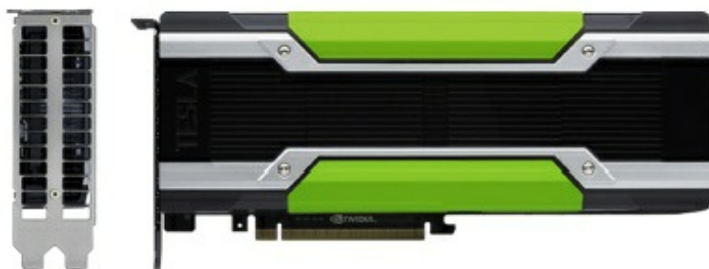
Figure 7. ThinkSystem NVIDIA Tesla M10 GPU

ThinkSystem NVIDIA Tesla M10 is a dual-slot 10.5 inch PCI Express 3.0 graphics card with four mid-range NVIDIA Maxwell graphics processing units (GPUs). The Tesla M10 has 32 GB GDDR5 memory (8 GB per GPU) and a 225 W maximum power limit. The board is passively cooled and supports both airflow directions.