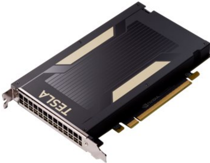
Figure 3. NVIDIA Tesla V100 FHHL GPU

The NVIDIA Tesla V100 FHHL GPU Accelerator for PCIe is a single-slot, full-height half-length (FHHL) PCI Express Gen 3 card with NVIDIA Volta graphics processing unit, 16GB HBM2 memory with native ECC support. It uses a passive heat sink for cooling. The Tesla V100 FHHL PCIe supports double precision (FP64), single precision (FP32) and half precision (FP16) compute tasks, unified virtual memory and page migration engine.