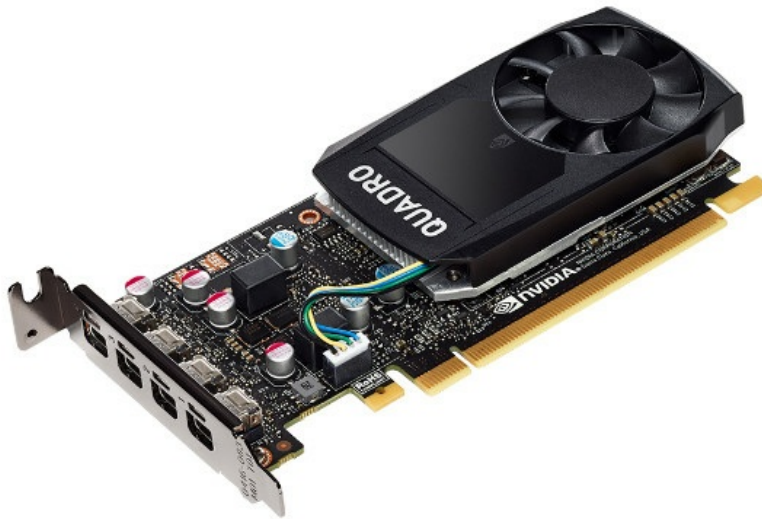
Figure 15. ThinkSystem NVIDIA Quadro P620 GPU

The NVIDIA Quadro P620 workstation graphics board is powered by NVIDIA Pascal GPU technology and 2 GB of GDDR5 memory. The Quadro P620 graphics board is targeted for professional CAD, DCC and visualization designers, engineers and users. Get the budget friendly highest performing graphics board to drive today's demanding professional workflows in a compact footprint. Flexible single-slot and low-profile form factor makes this card compatible with even the most space and power constrained workstation chassis.