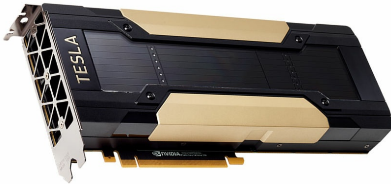
Figure 2. ThinkSystem NVIDIA Tesla V100

The NVIDIA Tesla V100 GPU Accelerator for PCIe is a dual-slot 10.5 inch PCI Express Gen3 card with a single NVIDIA Volta GV100 graphics processing unit (GPU), 16GB or 32GB HBM2 memory with native ECC support. It uses a passive heat sink for cooling. The Tesla V100 GPU supports double precision (FP64), single precision (FP32) and half precision (FP16) compute tasks, unified virtual memory and page migration engine.