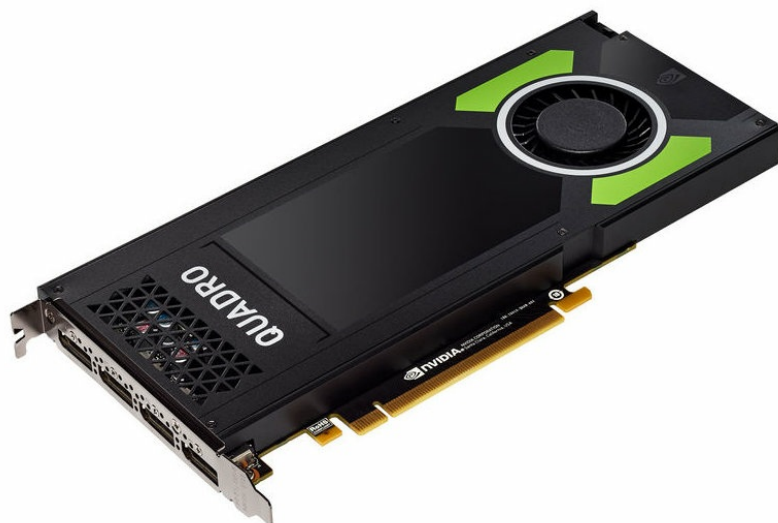
Figure 13. ThinkSystem NVIDIA Quadro P4000 GPU

The NVIDIA Quadro P4000 combines a 1792 CUDA core Pascal GPU, large 8 GB GDDR5 memory and advanced display technologies to deliver the performance and features that are required by demanding professional applications. The ability to create an expansive visual workspace of up to four 5K displays (5120x2880 @ 60Hz) with HDR color support lets you view your creations in stunning detail. The P4000 is specially designed with the performance that is necessary to drive immersive VR environments. Additionally, you can create massive digital signage solutions of up to thirty-two 4K displays per system by connecting multiple P4000s via Quadro Sync II2.