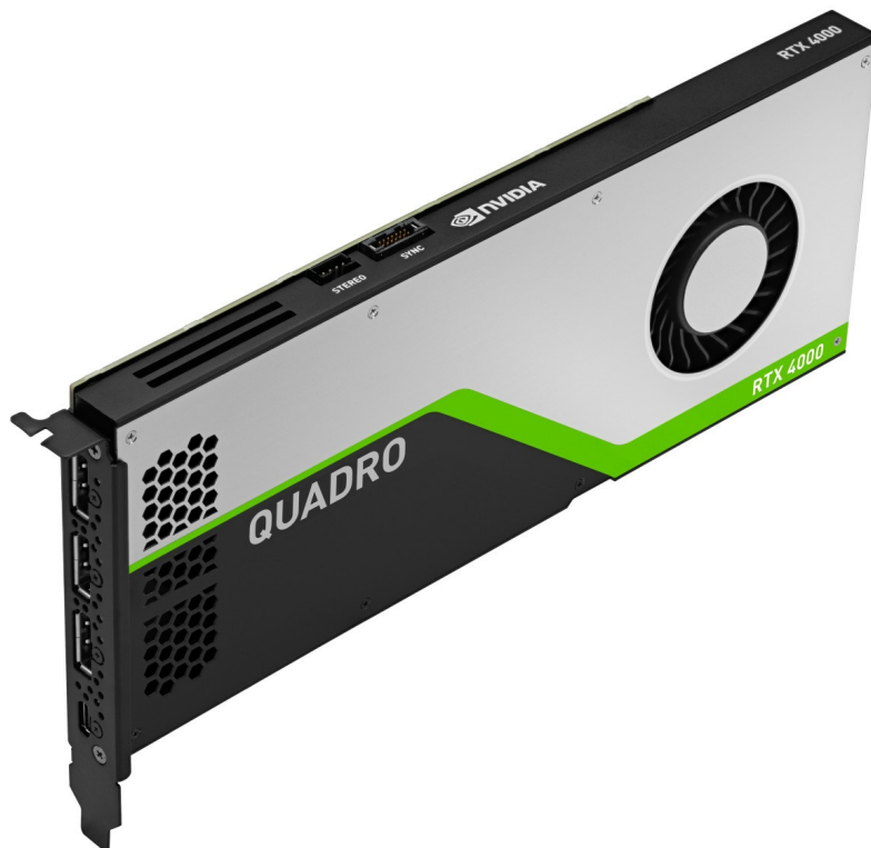
Figure 12. ThinkSystem NVIDIA Quadro RTX 4000 GPU

The Quadro RTX 4000 is equipped with 2304 CUDA cores, 288 Tensor Cores, 36 RT cores and 8 GB GDDR6 memory. The single-slot GPU is designed to manage the most intensive AEC, DCC, AI, VR and graphics workloads.