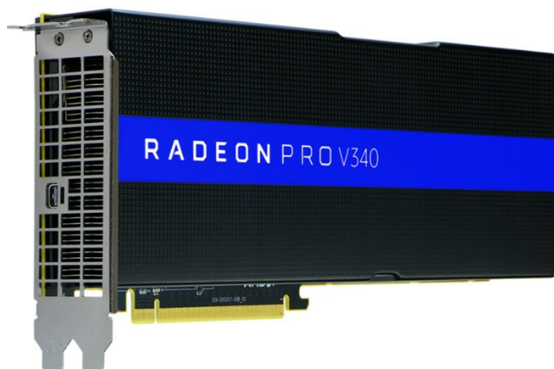
Figure 8. ThinkSystem AMD Radeon Pro V340 GPU

The AMD Radeon Pro V340 delivers a smooth GPU experience to every virtual application and desktop. It is a dual GPU card that is purpose-built to deliver extreme performance along with maximum user density for virtualized graphics, delivered from on-premise VDI environments or from the cloud. Based on AMD's MxGPU (Multiuser) technology, the Radeon Pro V340 gives every VM the benefits of having a high performance graphics card, giving users the visual experience they expect without having an actual GPU in their system.