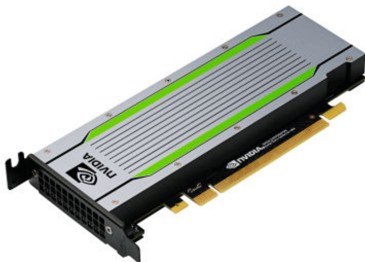
Figure 5. ThinkSystem NVIDIA Tesla T4 GPU

Tesla T4 provides revolutionary multi-precision performance to accelerate deep learning and machine learning training and inference, video transcoding and virtual desktops. Powering performance from FP32 to FP16 to INT8, as well as INT4 precisions, T4 delivers up to 40x higher performance than CPUs. As part of the NVIDIA AI platform, Tesla T4 supports all AI frameworks and network types, delivering dramatic performance and efficiency.