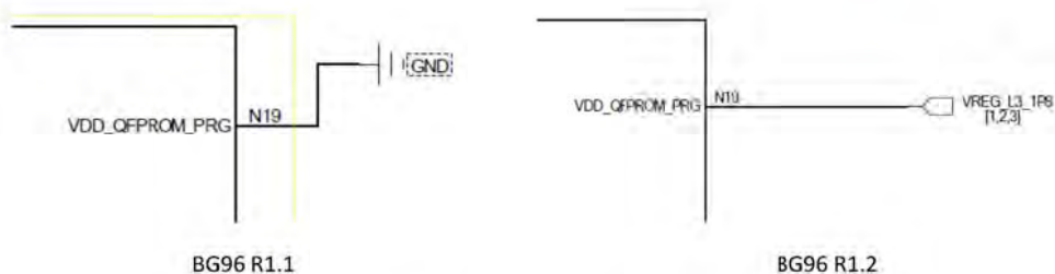
Figure 1: Schematic Designs of BG96 R1.1 and R1.2