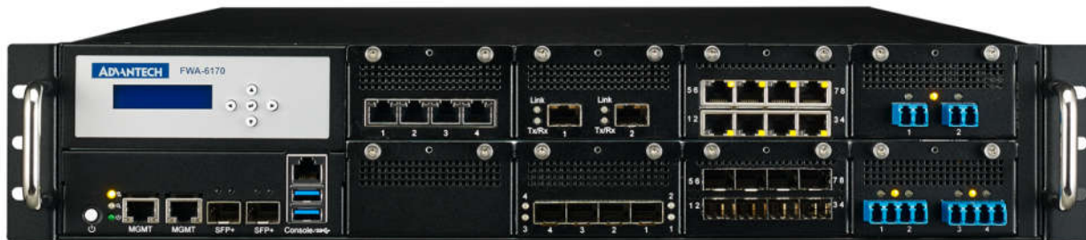
Figure 1. Advantech FWA-6170 with 7 out of 8 Network Mezzanine Cards (NMC) slots populated