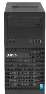
AXIS S9001 Desktop Terminal sold separately