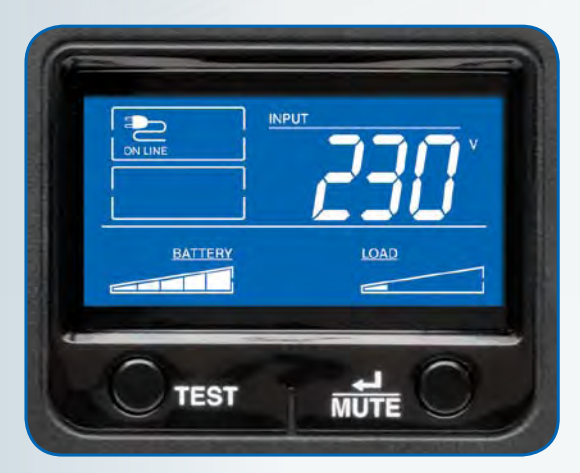
Multifunction LCD Status Screen