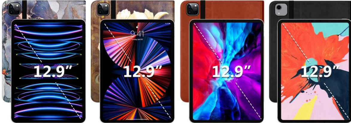
iPad Pro 12.9" 6th (2022)