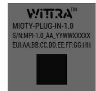
(SCALE 1: 1)