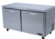
* KUCR-60-2 $6,130 KUCF-60-2 $7,580