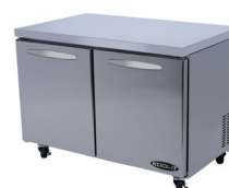
* KUCR-48-2 $5,400 KUCF-48-2 $6,540