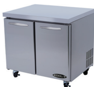
* KUCR-36-2 $4,950 KUCF-36-2 $5,940