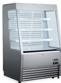
KOM-36SS $8,880 KOM-48SS $12,830