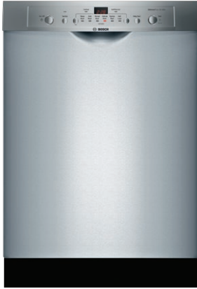
SHE3AR75UC Stainless Steel