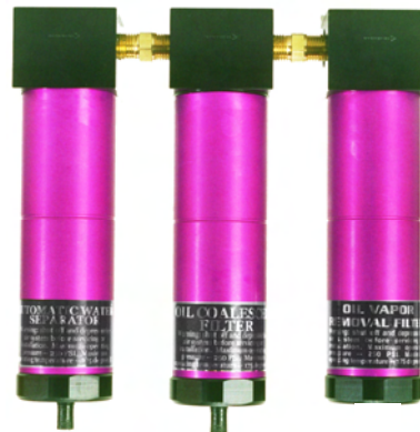
P/N 21999-0421 Tsunami™ 3-stage Filter System (separator / oil coalescing / activated carbon)