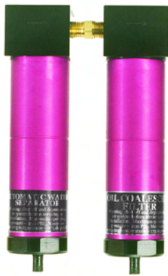
P/N 21999-0424 Tsunami™ 2-stage Filter System (separator and oil coalescing filter)