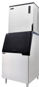
KCM-1100-AH (Bin not included)