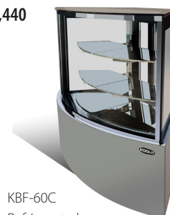
KBF-60C Refrigerated Corner Display Case