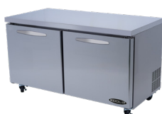
* KUCR-60-2 $4,460 KUCF-60-2 $5,470