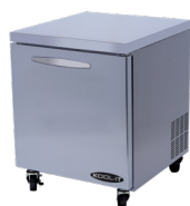
* KUCR-27-1 $2,890 KUCF-27-1 $3,330