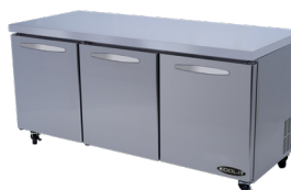
* KUCR-72-3 $5,150

KUCR series can be ordered with drawers. For prices, please call MVP sales office