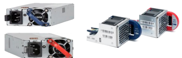
Hot swap and reversible power supply and fan modules