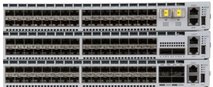
Arista 7280E Flexible Port Combinations

7280SE-64: 4 QSFP+ ports for 4x 40G or 16x10G