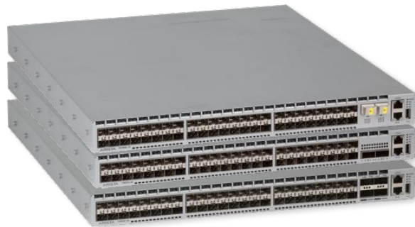
Arista 7280E family

All models in the 7280E Series deliver rich layer 2 and layer 3 features with wire speed performance up to 1.44 Terabits per second. The Arista 7280E Series offer a virtual output queue architecture combined with an ultra-deep 9GB of packet buffers that eliminates head of line blocking and allows for lossless forwarding under sustained congestion and the most demanding application loads. Combined with Arista EOS the 7280E Series delivers advanced features for HPC, big data, content delivery, cloud and virtualized environments.