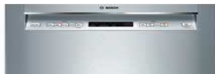
Recessed Handle SHEM63W55N—Stainless Steel SHEM63W52N—White SHEM63W56N—Black