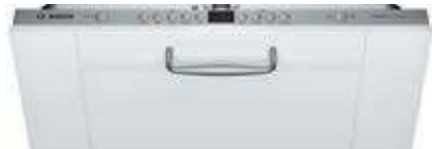
Custom SHVM63W53N—Custom Panel