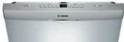
Scoop Handle SHSM63W55N—Stainless Steel SHSM63W52N—White SHSM63W56N—Black