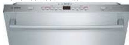
Bar Handle SHXM63W55N—Stainless Steel