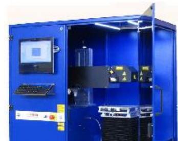
Visualisation e.g. for industrial production machines