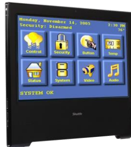
Smart Home Control Surveillance, Home Automation