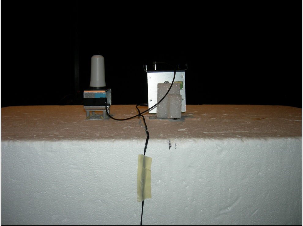
Figure 2: Radiated Emissions - XPOS