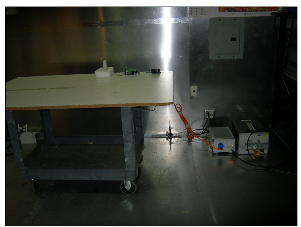
Figure 7: Conducted Emissions