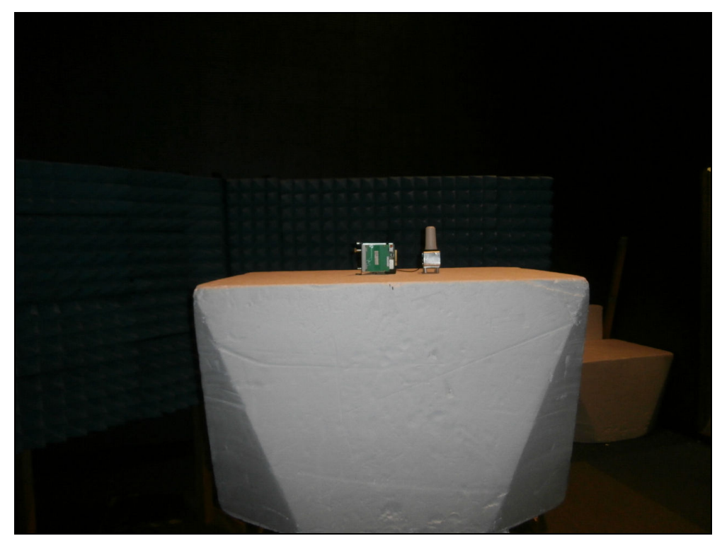
Figure 3: Radiated Emissions – YPOS