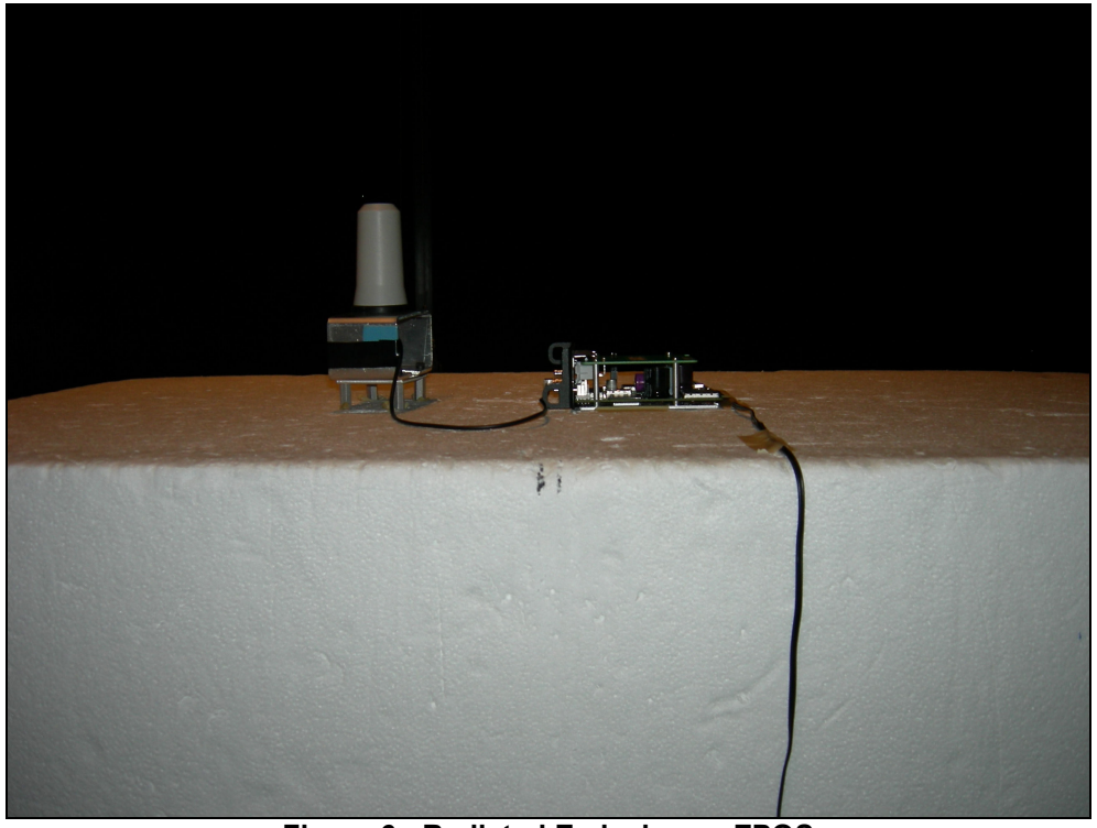
Figure 6: Radiated Emissions – ZPOS