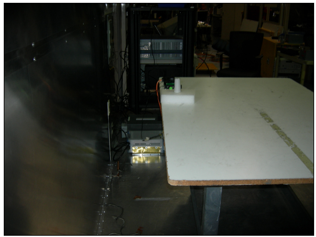
Figure 8: Conducted Emissions