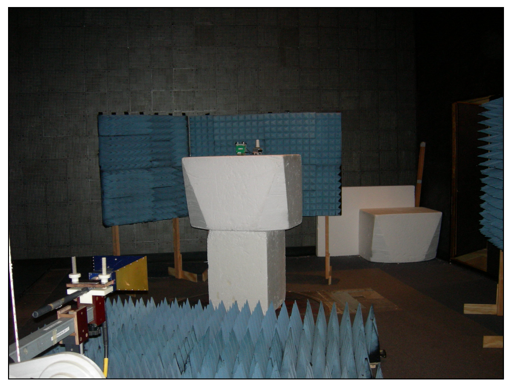
Figure 1: Radiated Emissions - XPOS