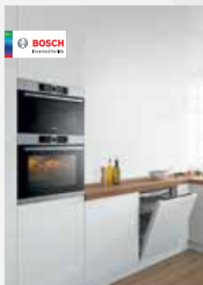
Oven and Compact Range.