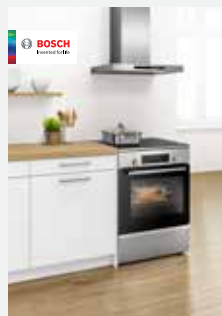
Freestanding Cooker Range.