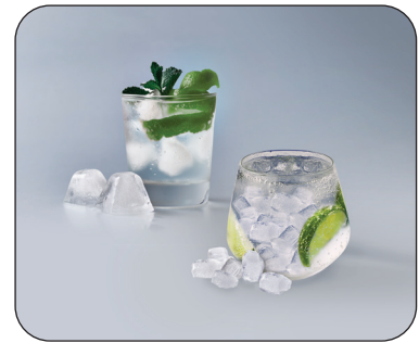
Dual Ice Maker with Ice Bites