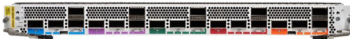
Figure 3. Cisco ASR 9903 Series 2T Port Expansion Card

Table 1 lists the features and benefits of the ASR 9903 router. Specific features and scale support are hardware and software dependent.