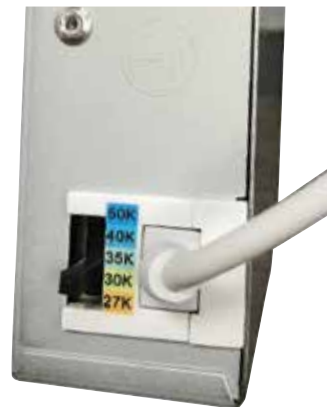
ProLED Select Slim Downlight