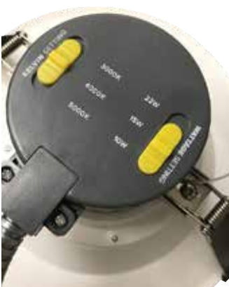
ProLED Select Commercial Downlight Retrofit