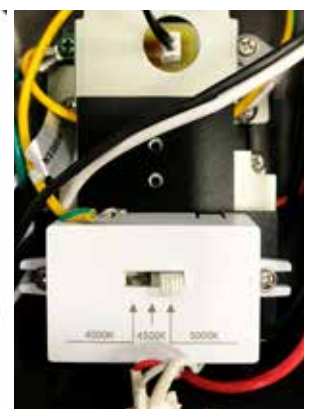
ProLED Select SekurPak Wallpack