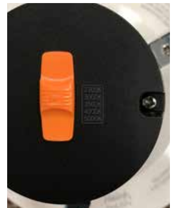
ProLED Select Downlight Retrofit