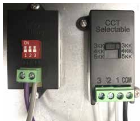
ProLED Select Wallpack