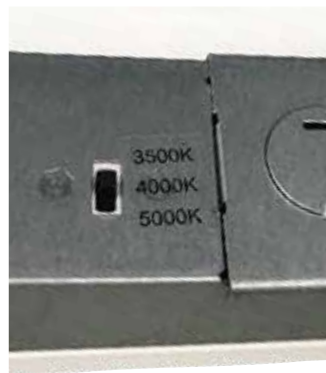
ProLED Select Backlit Panel