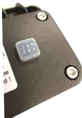
ProLED Select Flood Light