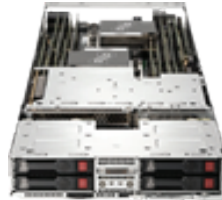
HPE ProLiant XL230a Gen9 Server