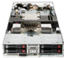
HPE ProLiant XL260a Gen9 Server