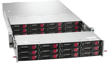
HPE Apollo 4200 Gen9 LFF Server