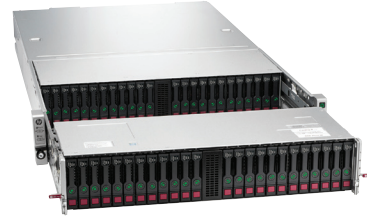
HPE Apollo 4200 Gen9 SFF Server