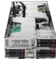
HPE ProLiant XL250a Gen9 Server