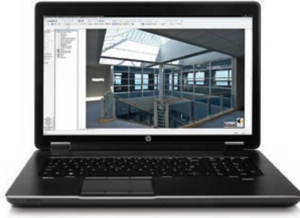
HP ZBook 17 Mobile Workstation

Inspire creativity with the incredible expandability of HP's most powerful mobile workstation.