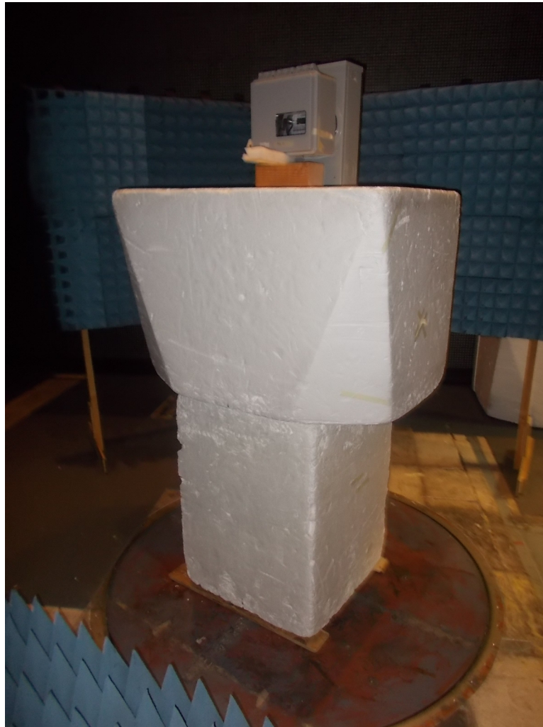
Figure 2: Equipment Under Test – Front View