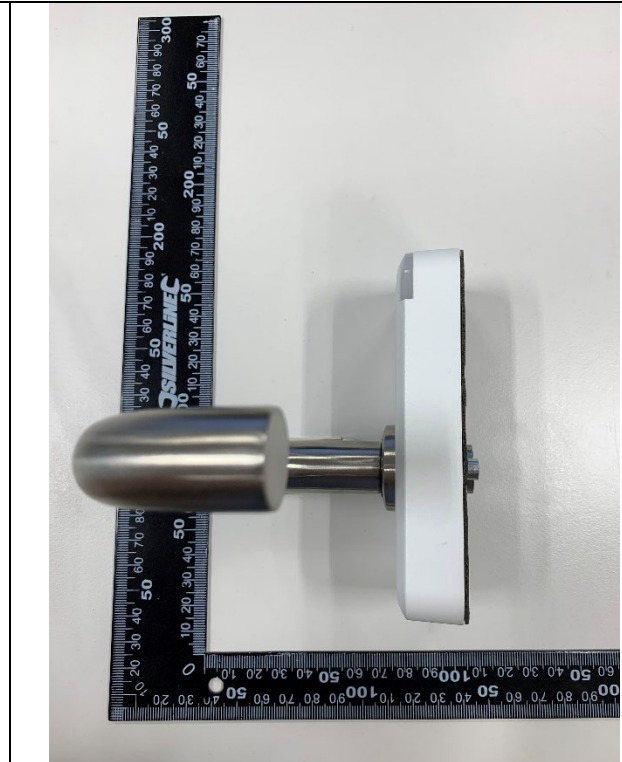
Photo 6: Side view of the part of the lock located on the outside of the door.