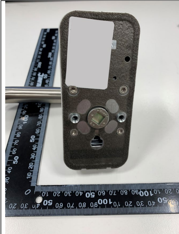
Photo 5: Back of the part of the lock located on the outside of the door.