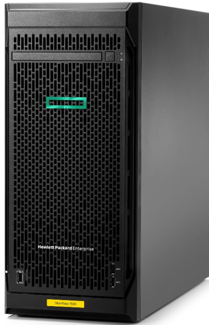
HPE StoreEasy 1560 Storage

HPE StoreEasy 1560 Storage solutions are built on a compact and affordable tower form factor package and deliver multi-protocol file serving and application storage to environments that don't have rack space, including small workgroups, small businesses, and remote offices. All HPE StoreEasy 1560 models come with the operating system pre-installed on the four internal LFF drives.