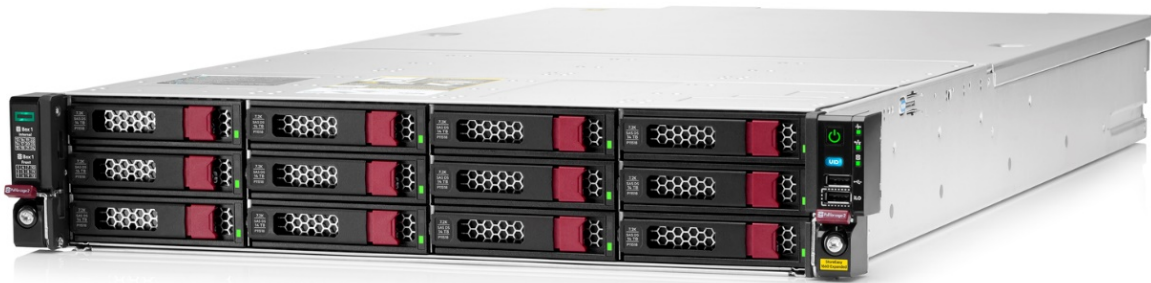
HPE StoreEasy 1660 Expanded Storage

The HPE StoreEasy 1660 Expanded Storage is a density-optimized (with 28 LFF hot-plug drive slots) 2U rack-mount form factor platform ideal for bulk file and secondary storage workloads. All StoreEasy 1660 Expanded models come with the operating system pre-installed on mirrored solid state drives.