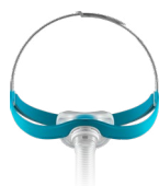
F&P Evora™ Nasal Compact Nasal Mask