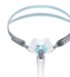
F&P Brevida™ Nasal Pillows Mask

Prescription only. Use only as directed. Always follow the instructions for use. Your healthcare professional will advise you whether this product is suitable for you/your condition.