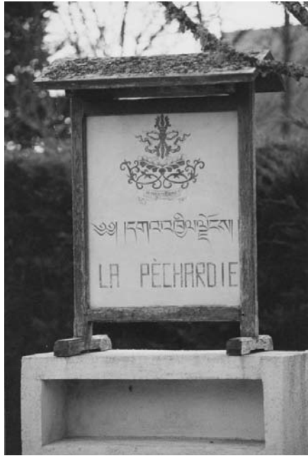
below: HH's home with prayer flags (Dordogne).