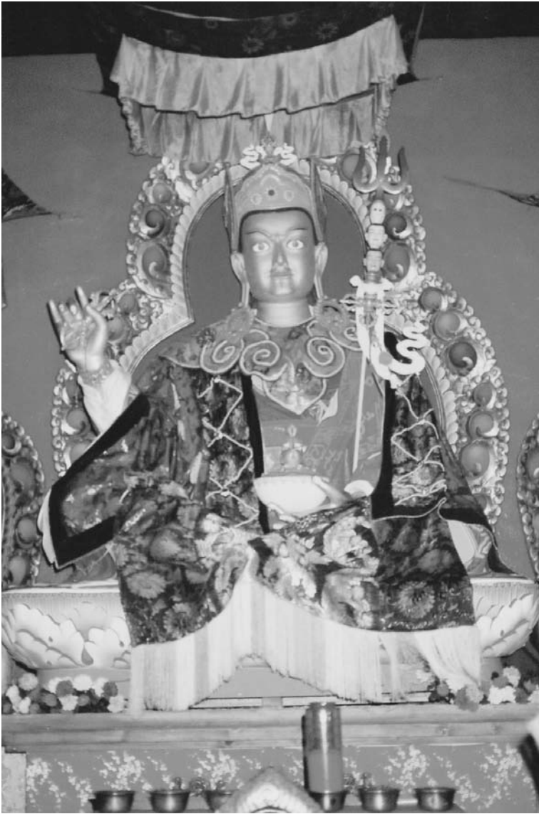
From Dudjom Rinpoché's public shrine room in Dordogne, France