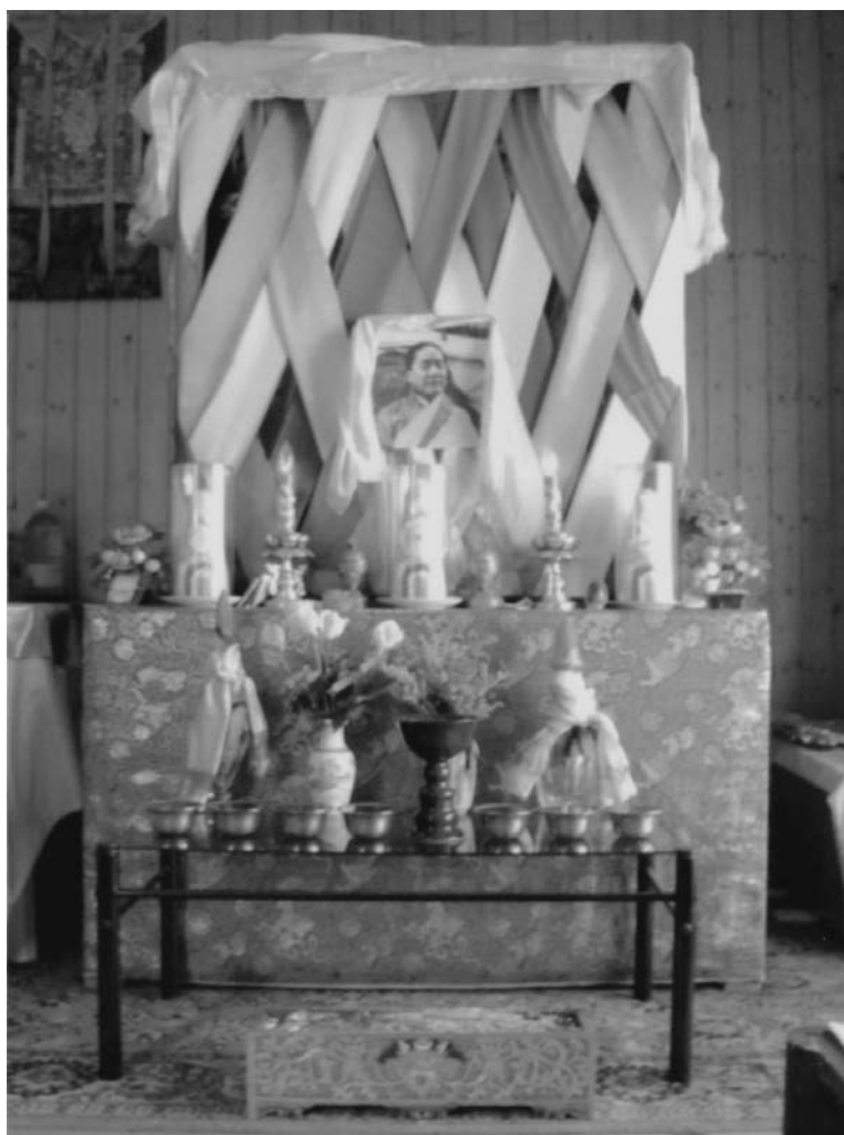
HH's practice seat and where he entered parinirvana in his room (Dordogne).