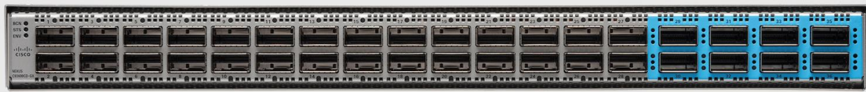
Figure 2. Cisco Nexus 93600CD Switch

The Cisco Nexus 93600CD-GX Switch (Figure 2) is a 1RU switch that supports 12 Tbps of bandwidth and 4.0 bpps across 28 fixed 40/100G QSFP-28 ports and 8 fixed 10/25/40/50/100/200/400G QSFP-DD ports. The 28 ports support 10/25-Gbps. Please see feature table below for more information.