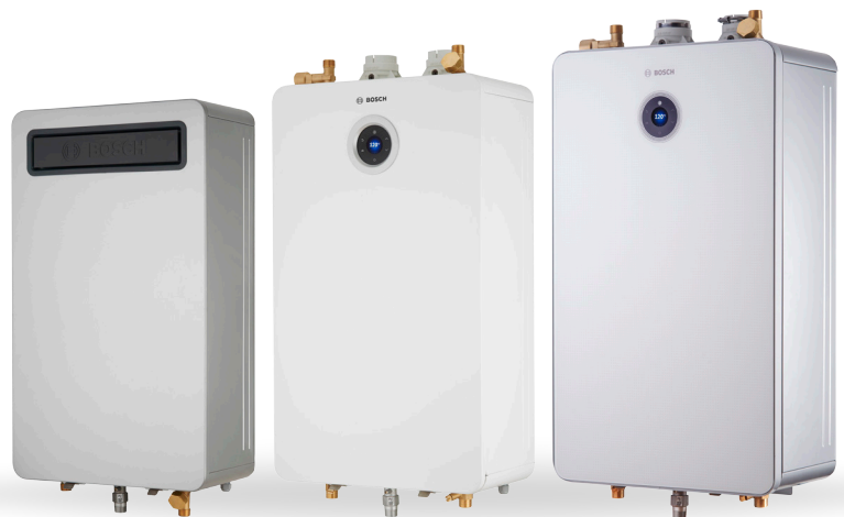
Greentherm T9800 SE outdoor