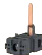
Insulated Comb-Type Busbar Connector