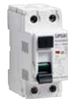
Two Module RCBO