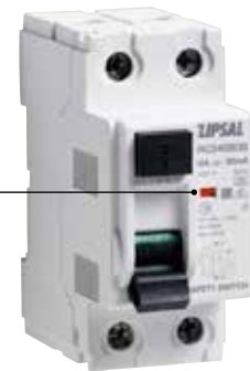
Residual Current Device (RCD)

Busbar compatibility has never been easier. An insulated neutral slot means that quick fit-off can be achieved as there is no need to cut the busbar.