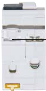
RCBM220/30 Insulated busbar slot

SLIM RCBO available to save valuable switchboard space.