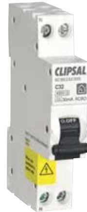
Combination Residual Current Device SLIM (RCBO)

Top and bottom line load compatible for easy installation.