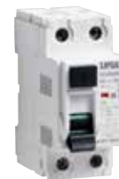
RCD Two Pole