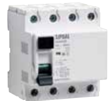
RCD Four Pole