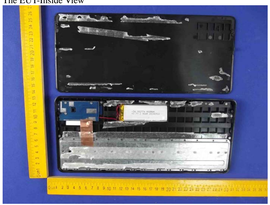
Figure 7 The EUT-Inside View