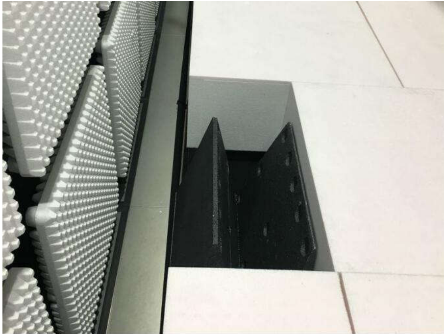
Radiated spurious emission Test Setup-3(Above 1GHz) There are absorbing materials under the ground.