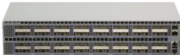
Figure 6: Arista 7260CX-64 series

The 7260CX-64 is a 2 RU system that provides 64 QSFP100 ports and 2 SFP+ ports. Each QSFP100 port can be individually broken out into 4 ports of 10GbE or 25GbE; 2 ports of 50GbE or used as a single port of 40GbE or 100GbE.