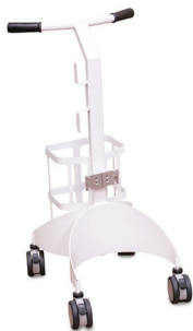
Prevalon Air Pump Cart 1 cart/case Reorder #7475