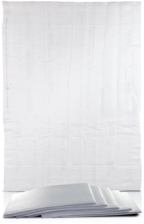
M² Microclimate Body Pad 36" x 51"

30 pads/case (6 bags of 5) Reorder #7250