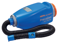
Prevalon Air Pump - 120V 1/case Reorder #7455