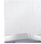
Microclimate Management Pad 23" x 36"

XXL 57" x 45" 20 pads/case (4 bags of 5) Reorder #7260