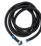
25' inflation hose 1/case Reorder #7443