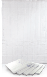
M² Microclimate Body Pad XL / XXL

30 pads/case (6 bags of 5) Reorder #7250