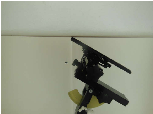
Curved Surface of Edge3