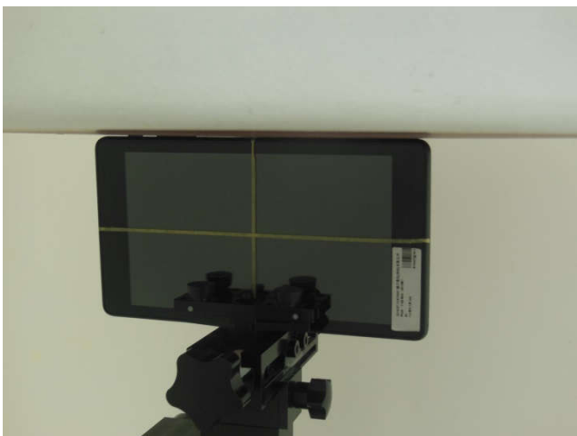
Edge2, Test Separation 0 mm