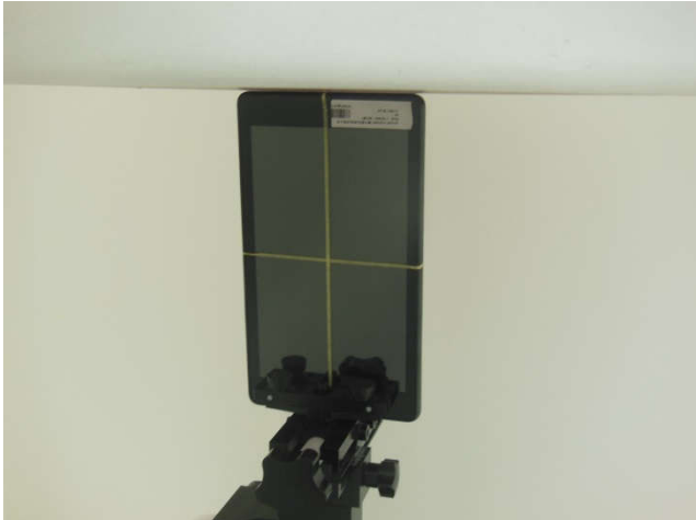
Edge3, Test Separation 0 mm