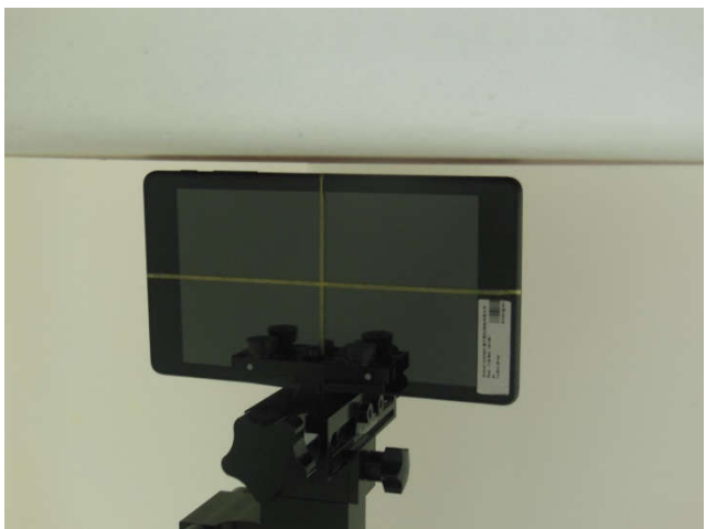
Edge2, Test Separation 5 mm