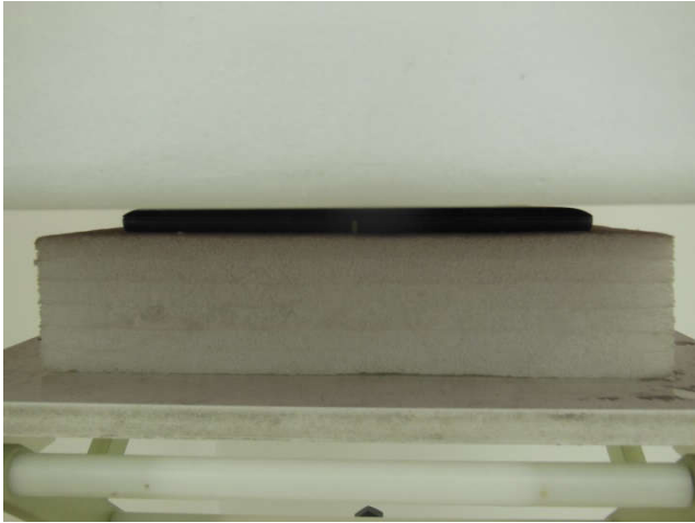
Bottom Face, Test Separation 0 mm