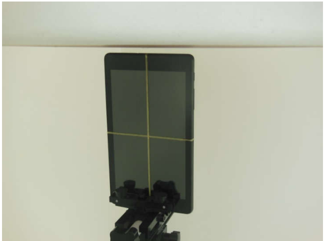
Edge1, Test Separation 6 mm