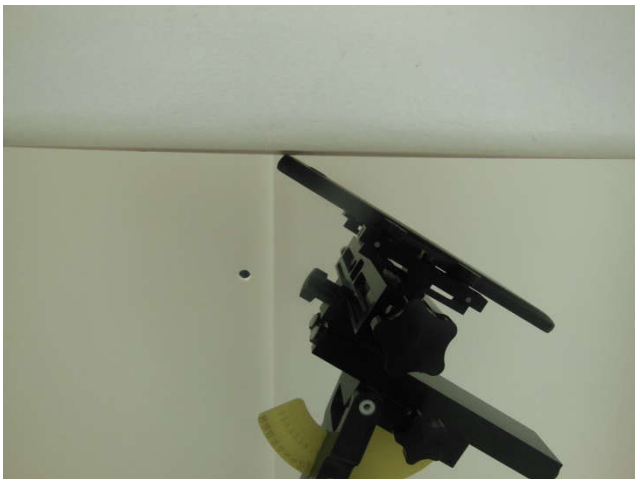
Curved Surface of Edge1