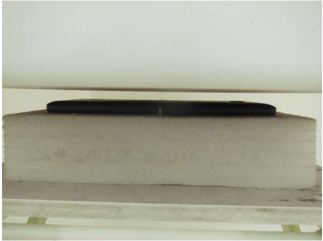
Bottom Face, Test Separation 9mm