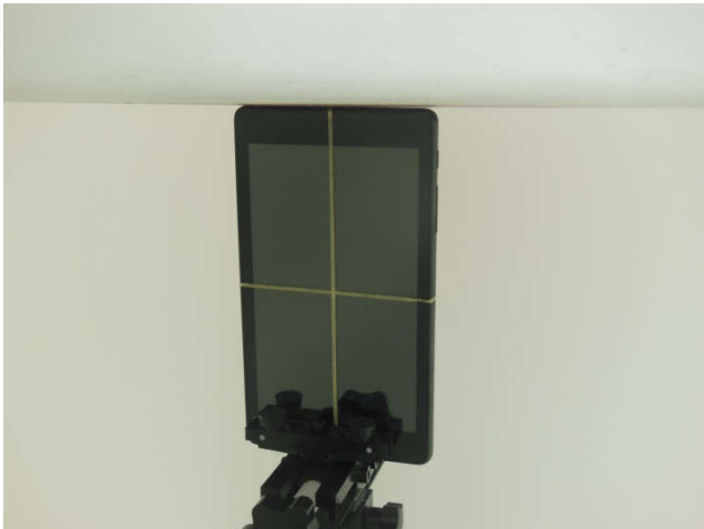
Edge1, Test Separation 0 mm