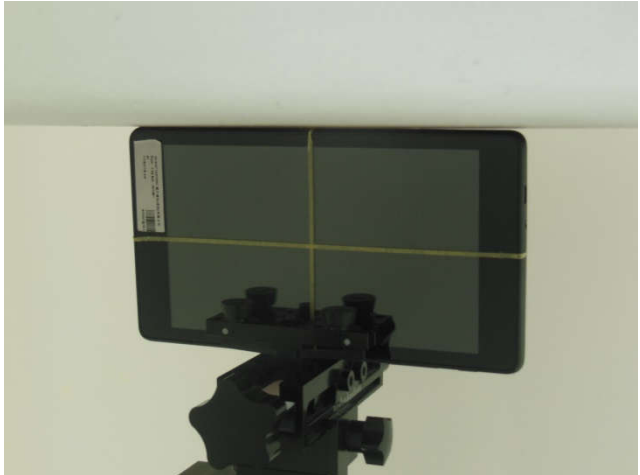
Edge4, Test Separation 0 mm