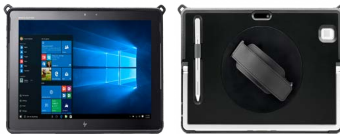
HP Elite x2 1012 G2 Protective Case