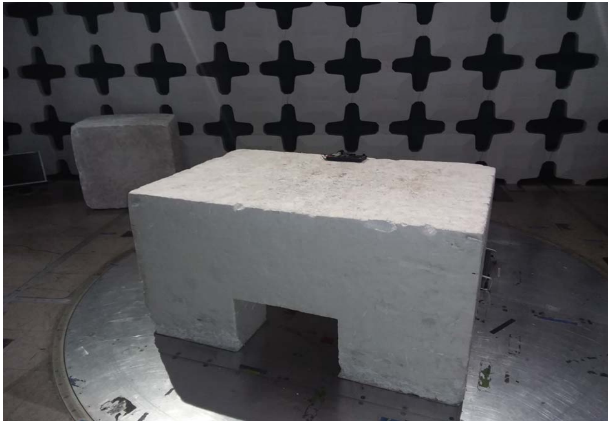
Test Configuration Photograph #1 (radiated)