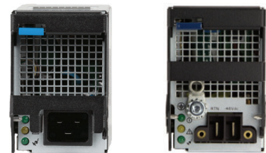
Arista 7300X Series Power Supplies

The AC power supplies are highly efficient in both platinum or titanium climate saver rated options and have an efficiency of over 93% with single stage conversion to the internal DC voltage. The DC power supplies require inputs at -48V DC to deliver up to 3000W. The 7300 Series uses multiple small power supplies which allows for incremental provisioning and smaller input circuits. Variable power supply fan speeds ensure power supply efficiency is optimized and reduces noise in data center environments.