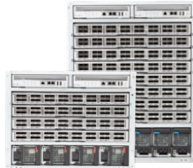
Arista 7300X Series Modular Data Center Switches

With reversible front-to-rear or rear-to-front airflow, redundant and hot swappable supervisor, power, fabric and cooling modules the system is purpose built for data centers. The 7300 Series is energy efficient with typical power consumption of under 3 watts per 10GbE port for a fully loaded chassis. All of these attributes make the Arista 7300 Series an ideal platform for building reliable, low latency, resilient and scalable data center networks. Combined with Arista EOS the 7300 Series delivers advanced features for big data, cloud, virtualized and traditional designs.