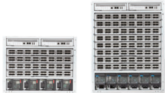
Arista 7300X Series Chassis

The midplane is completely passive and provides control plane connectivity to each of the fabric and line card modules. The system is optimized for data center deployments with front-to-rear and rear to front airflow options.