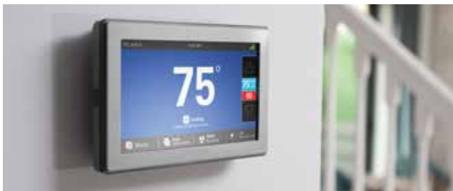
1. Trane ranked in the Top 3 in the proprietary Lifestory Research 2021 America’s Most Trusted® Smart Thermostat Brand study. Study results are based on experiences and perceptions of people surveyed. Your experiences may vary. Visit www.lifestoryresearch.com .

Trane® technology takes home comfort and energy savings to the next level—which is why they were named a 5-star Smart Thermostat in the 2021 America’s Most Trusted® Smart Thermostat Brand study. 1 With the Trane Home app, you can manage temperature settings and more than 400 smart home products directly from any web-enabled device—whether you’re at home or on the road. Plus, these thermostats are so smart they learn your temperature preferences, detect when you’re at home or away, and factor in your local weather.