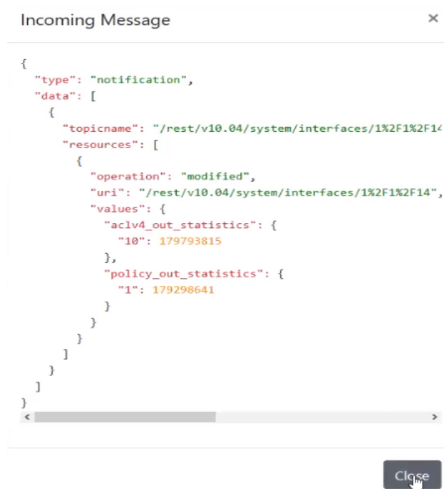
Figure 2 Subscription throttling notifications for on-demand attributes