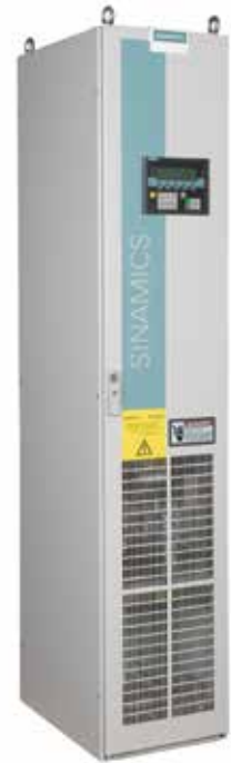
G150 type C with transport eye bolts (tophat removed)