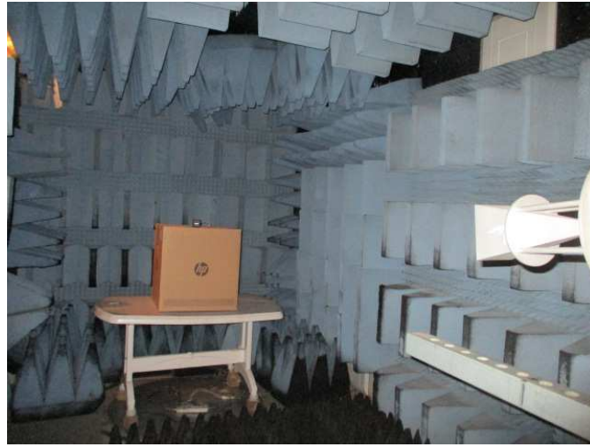
Figure 5. Radiated Emission Test, 18-26.5 GHz