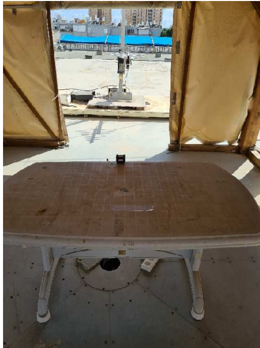
Figure 3. Radiated Emission Test, 200.0-1000.0 MHz