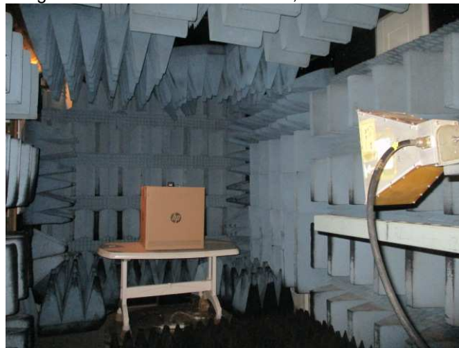
Figure 4. Radiated Emission Test, 1.0-18.0 GHz