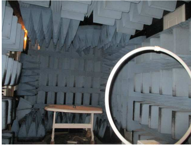
Figure 1. Radiated Emission Test, 0.009-30.0 MHz