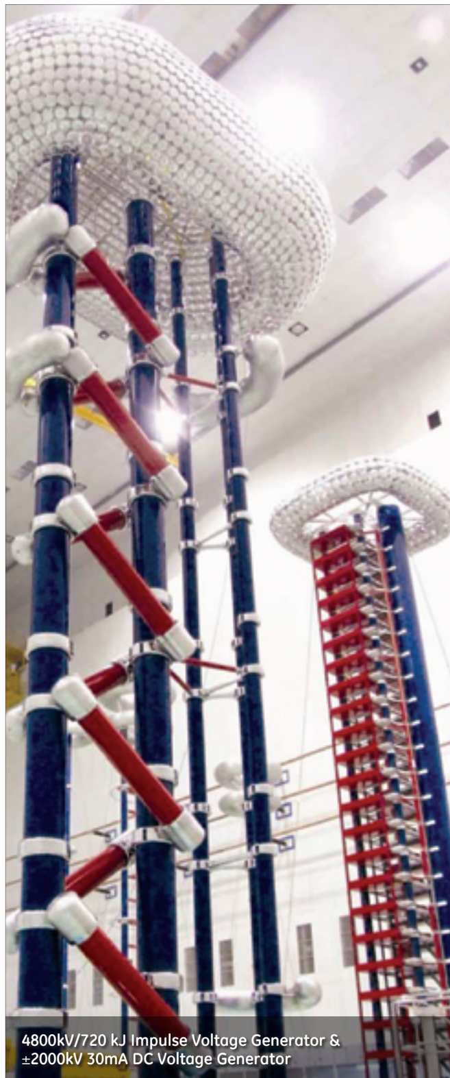
4800kV/720 kJ Impulse Voltage Generator & \pm 2000 kV 30mA DC Voltage Generator