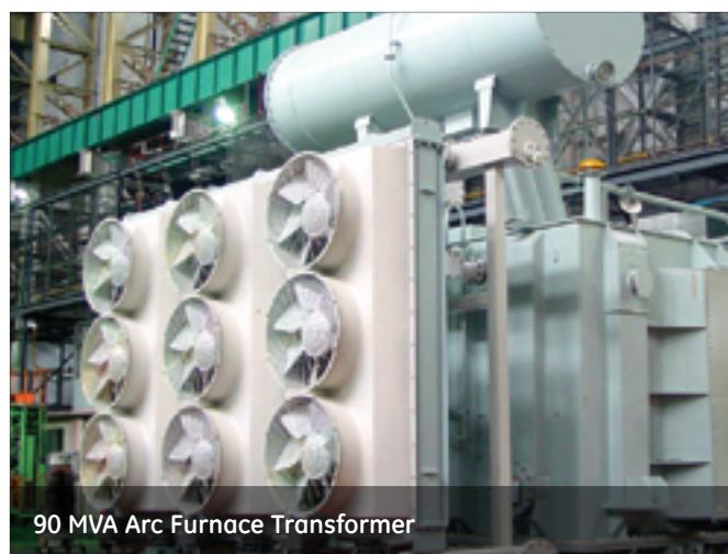
90 MVA Arc Furnace Transformer

XD|GE has developed the technology to produce a range of arc furnace transformers including arc steel-smelting furnace transformers, ladle refined furnace transformers, and large ore arc furnace transformers. XD|GE arc furnace transformers are available in AC and DC supply, with capacities up to 200 MVA with 35kV single-core design, up to 160 MVA with series voltage regulation, and up to 100 MVA with a primary voltage of 110kV.