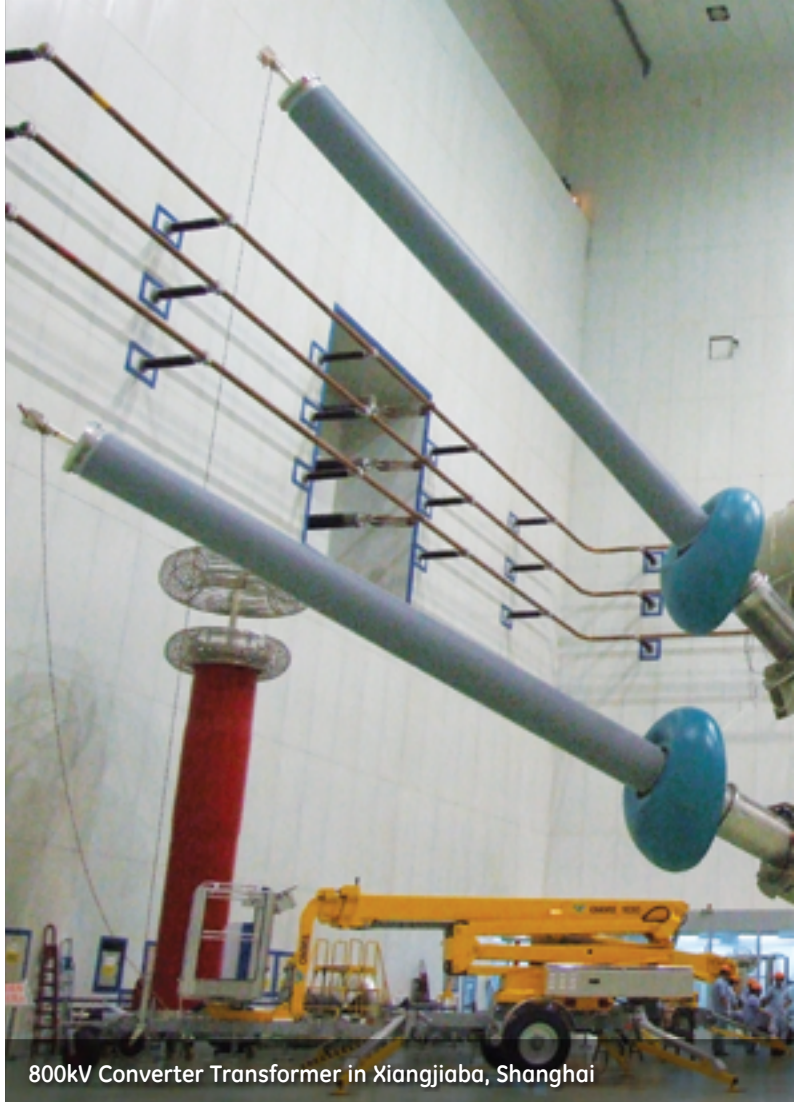
800kV Converter Transformer in Xiangjiaba, Shanghai