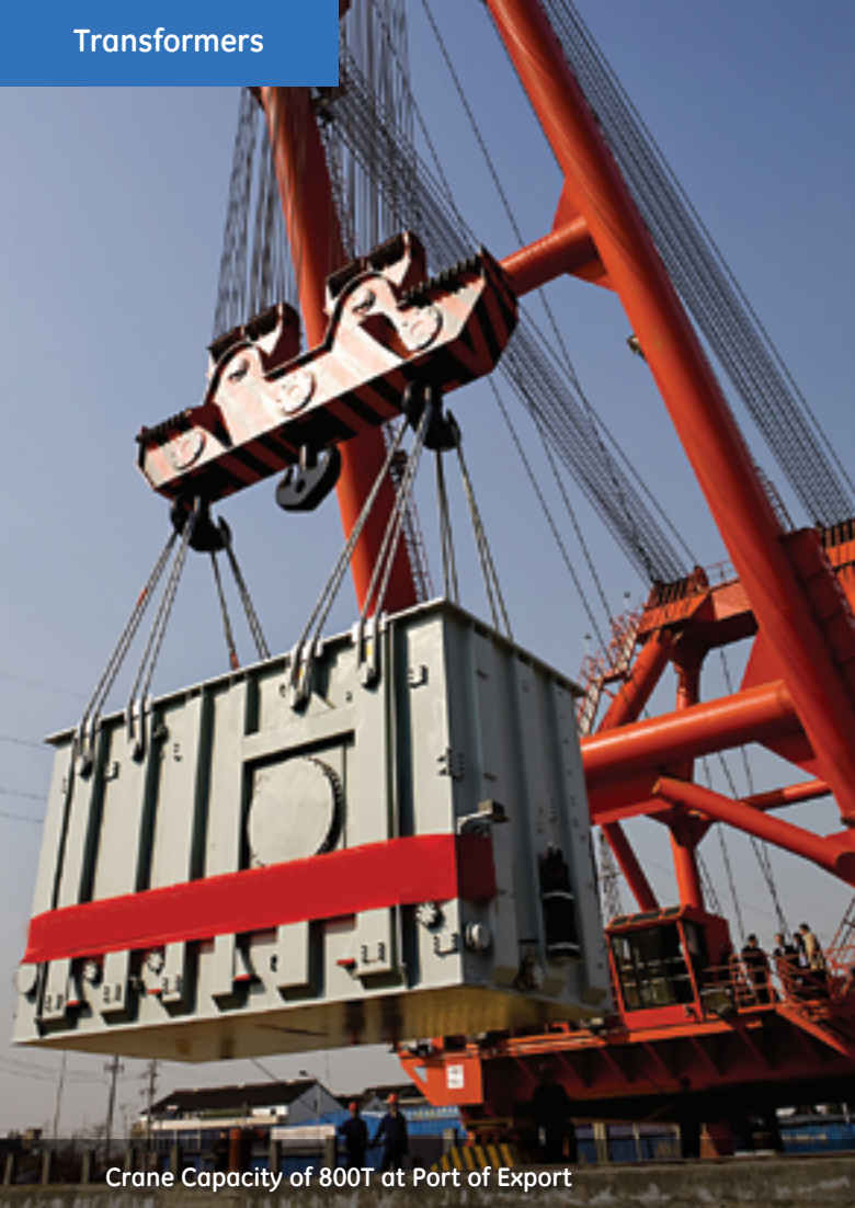
Crane Capacity of 800T at Port of Export