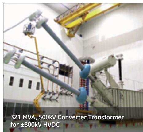
321 MVA, 500kV Converter Transformer for \pm 800\text{kV} HVDC