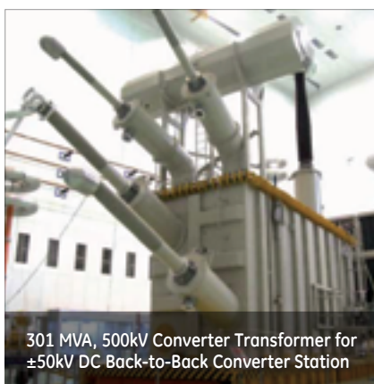
301 MVA, 500kV Converter Transformer for \pm 50\text{kV} DC Back-to-Back Converter Station