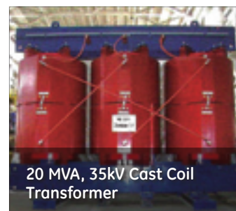
20 MVA, 35kV Cast Coil Transformer