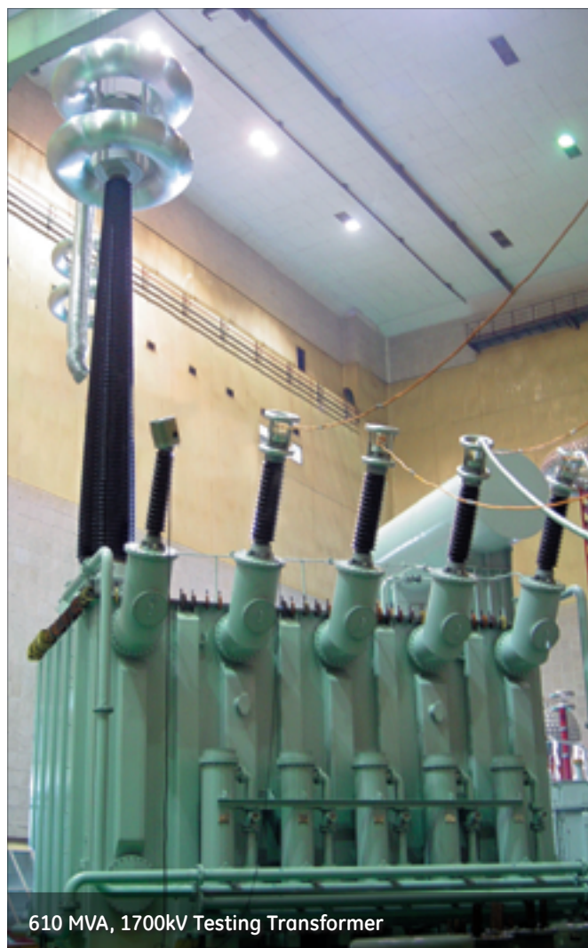
610 MVA, 1700kV Testing Transformer

Shunt reactors are core to XD|GE's portfolio, with more than 600 units installed, at 500kV or higher, in various regions around the world. As part of XD|GE's ongoing initiatives for continual product improvement, extensive research on shunt reactors has resulted in an improved core design. These improvements have reduced the total losses to less than 100kW,