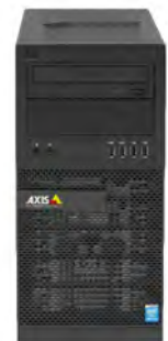
AXIS S9001 Desktop Terminal sold separately