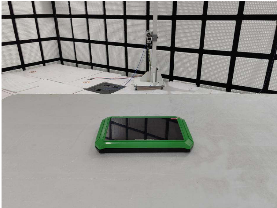
Radiated spurious emission Test Setup-3(Above 18GHz)