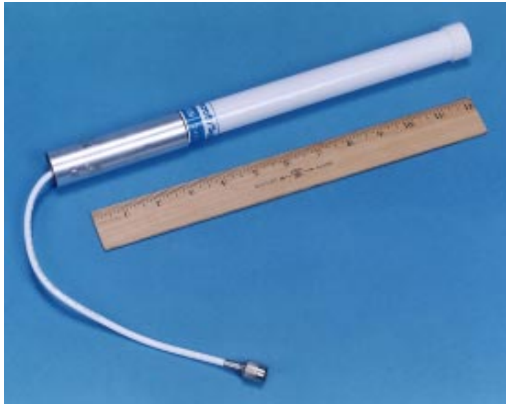
Figure 5: Ground Segment (Access Point) Antenna