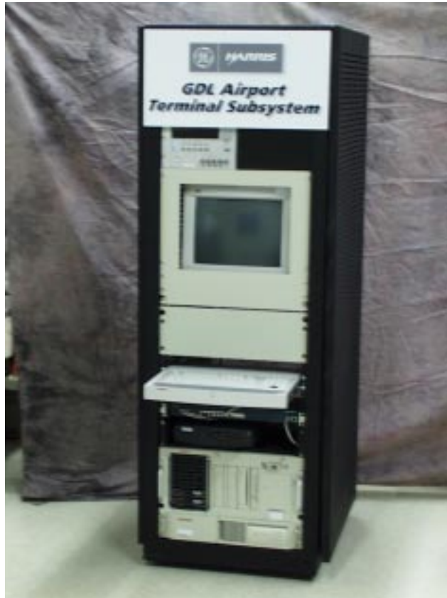
Figure 7: Representative Ground Segment Equipment Rack