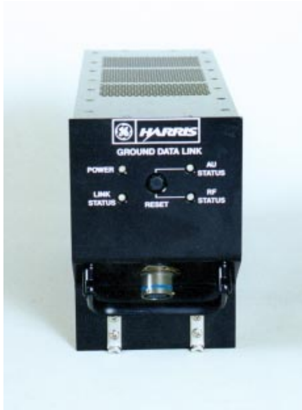
Figure 1: GDL Aircraft Unit