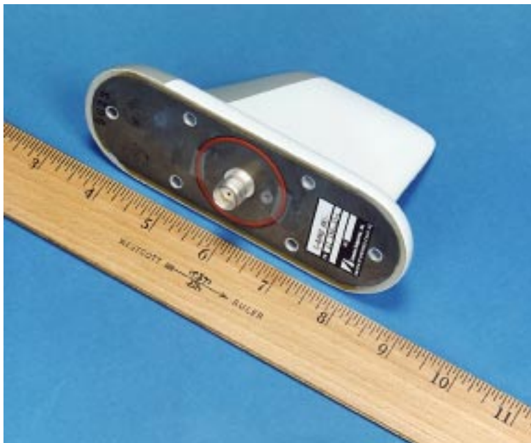
Figure 4: Aircraft Antenna – Bottom View