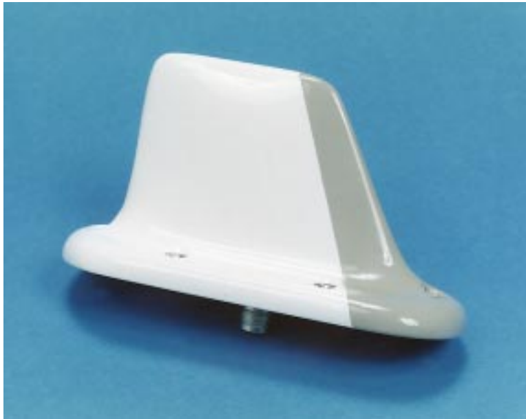
Figure 3: Aircraft Antenna – Side View