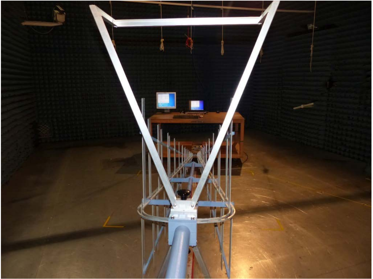
Photo 1: Test setup for radiated measurements (Enclosure, semi-anechoic chamber, 30 MHz to 1 GHz, unintentional radiator §15)