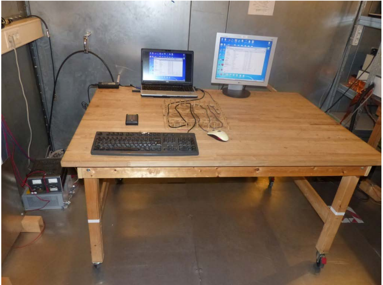
Photo 4: Test setup for conducted measurements (AC/DC adapter, 120 V/60 Hz, EMC insulated room, unintentional radiator, § 15)