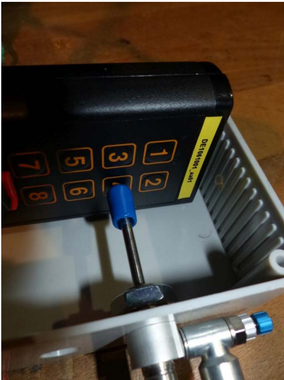
Photo 3: Test setup for radiated measurements – pneumatic finger – detail (Enclosure, semi-anechoic chamber, 30 MHz to 1 GHz, unintentional radiator §15)