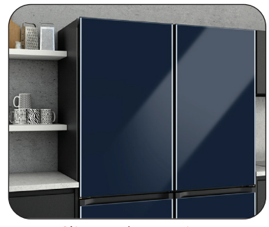
Slim, Modern Design